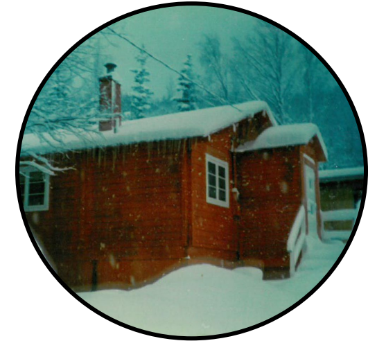
New School House

The first schoolhouse was built on the newly designated school property.