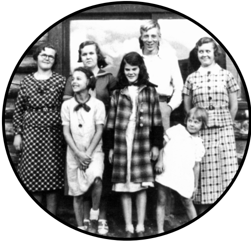
Where We Started

The first School was held in the Lean's Cabin. It was called the Riddiford School.