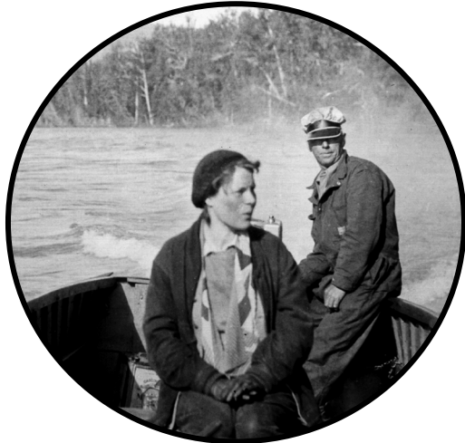
First School Teacher