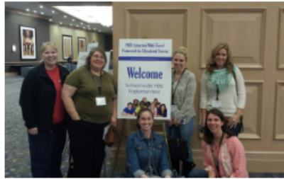
KPBSD PBIS implementers attending trainings.