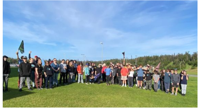
Mentor Pod Capture the flag day!