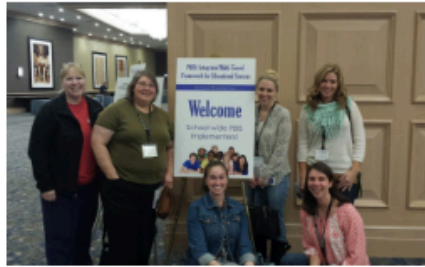
KPBSD PBIS implementers attending trainings.

Intervention ideas based on specific behaviors.