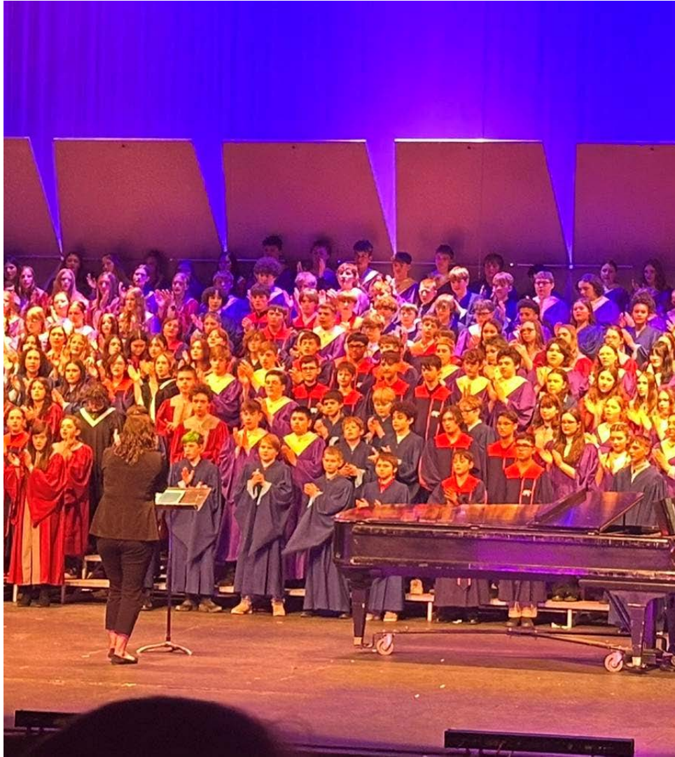
KPBSD Middle School Mass Choir