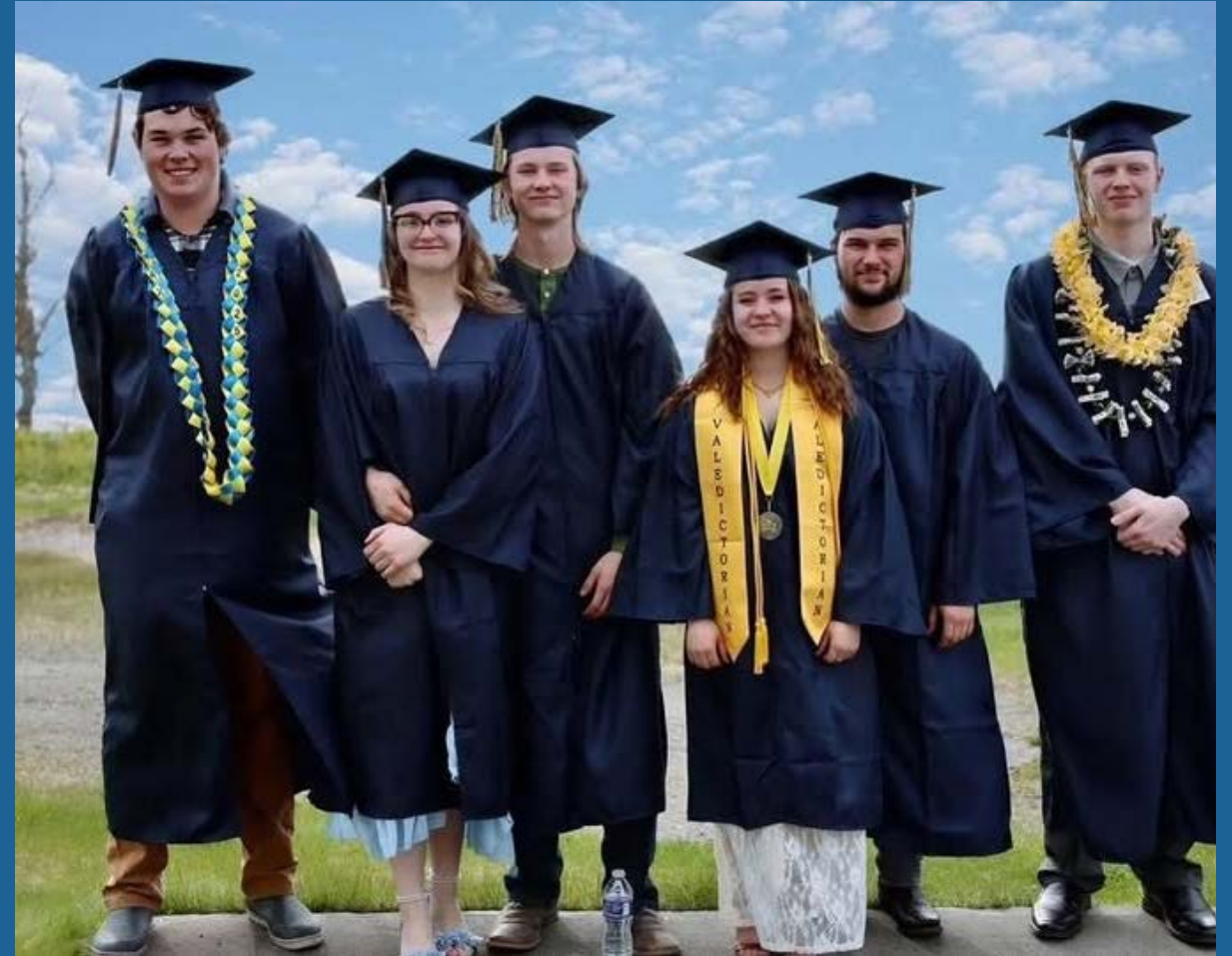
Ninilchik Class of 2025 Graduates

School consolidation is a necessary step to align resources with enrollment, ensuring our schools remain strong, sustainable, and focused on delivering the best education for every student.