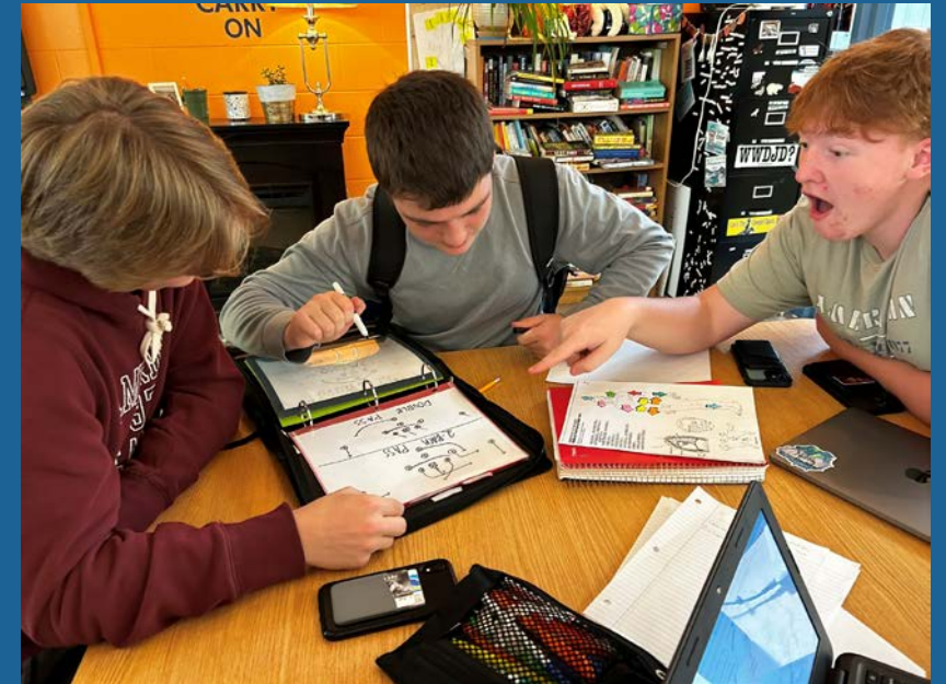
Nikiski HS Powderpuff Football Coaches