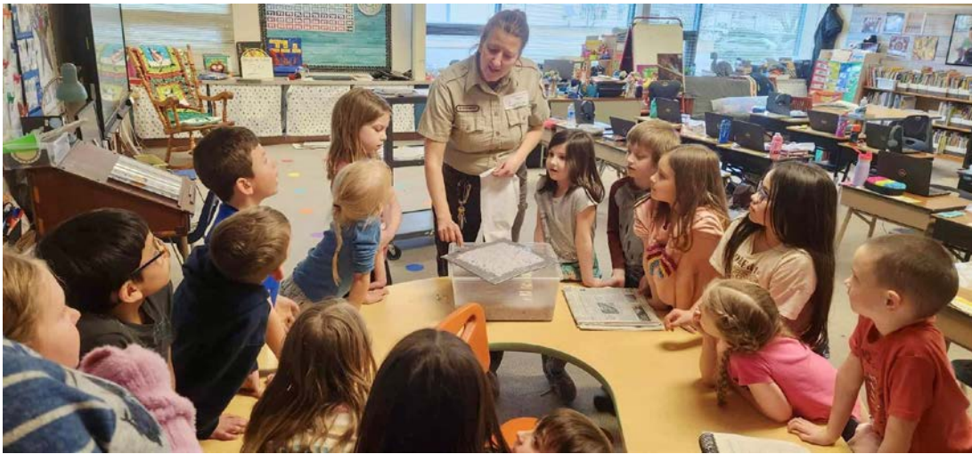
Soldotna Elementary students