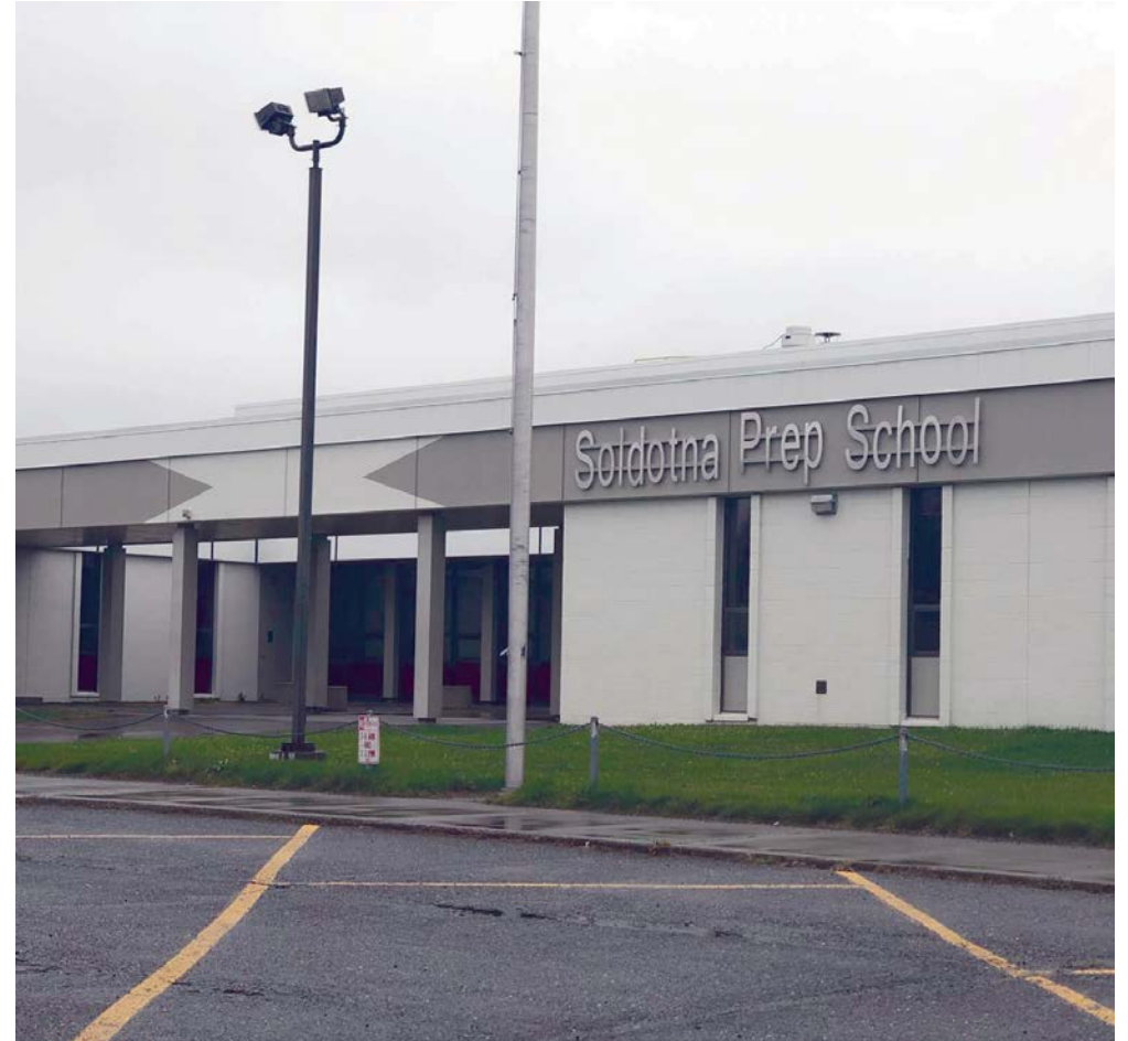
Soldotna Prep School