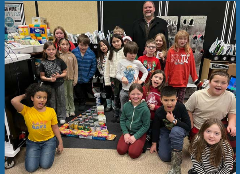
Redoubt Elementary Canned Food Drive