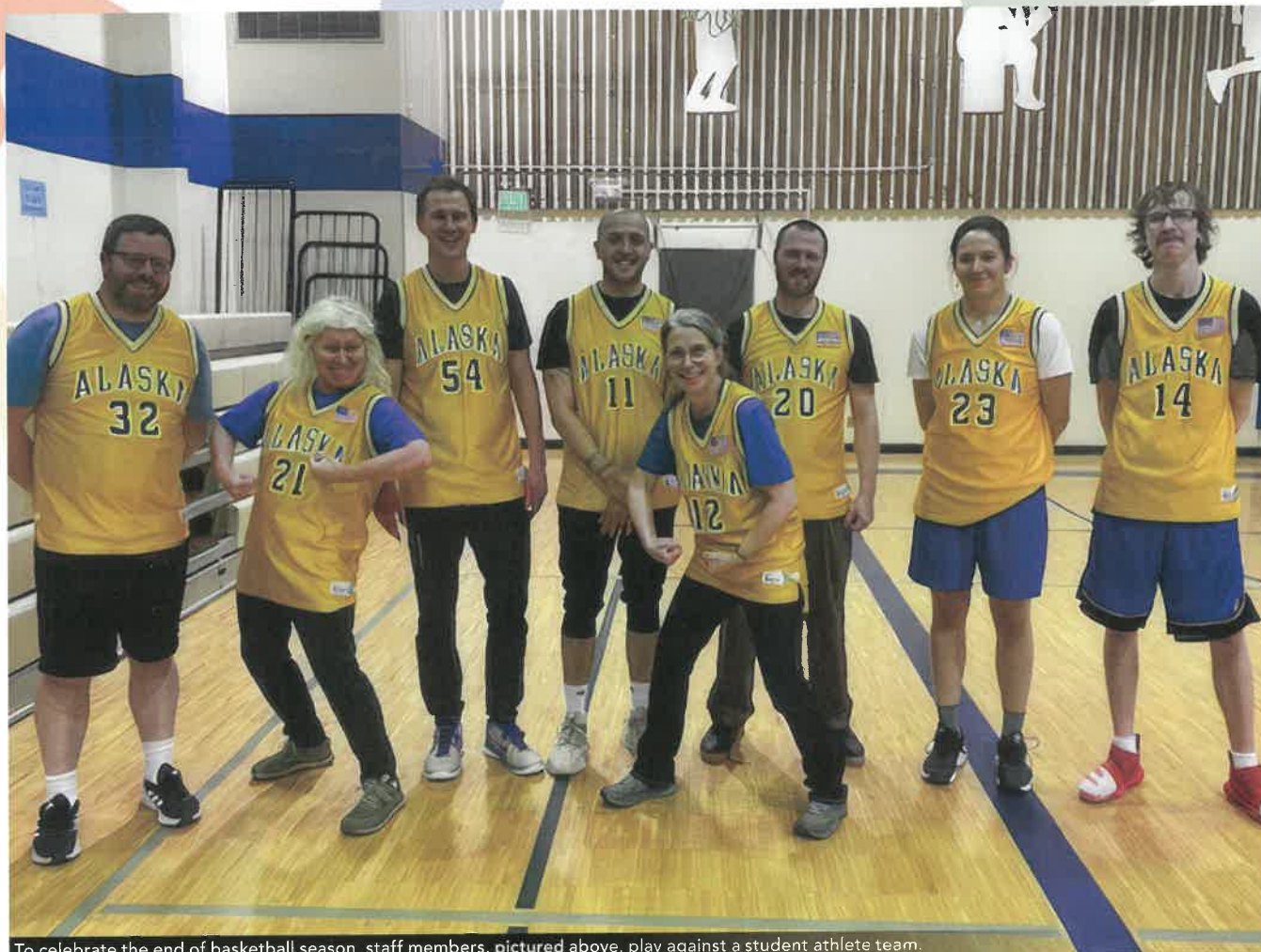
To celebrate the end of basketball season, staff members, pictured above, play against a student athlete team.