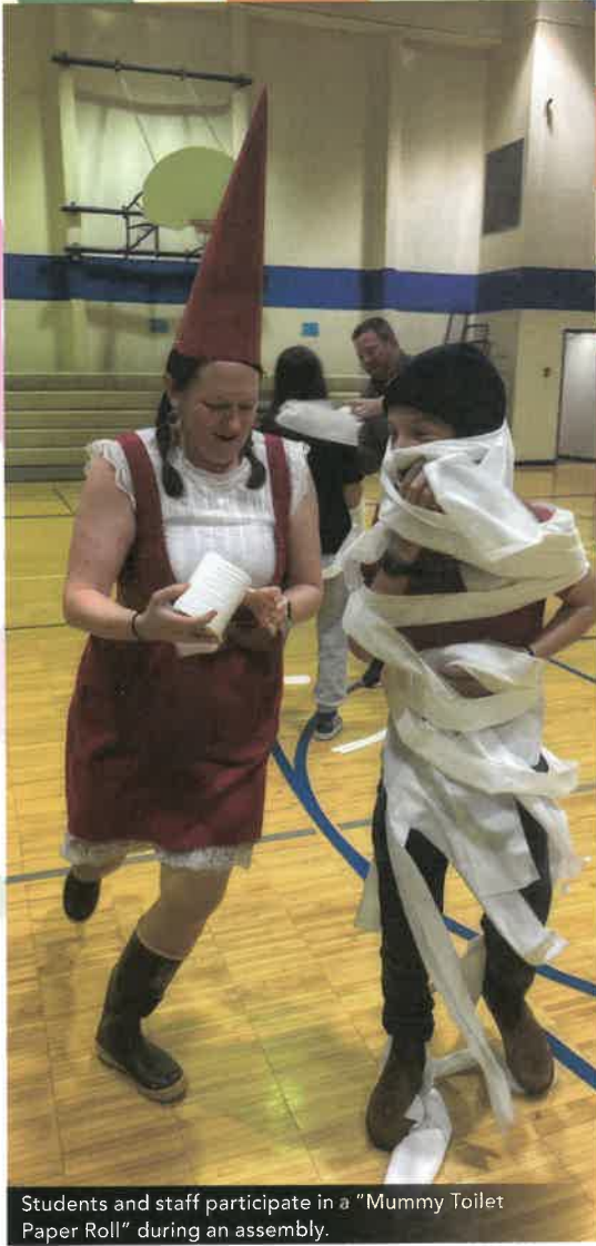
Students and staff participate in a "Mummy Toilet Paper Roll" during an assembly.

of our special education teachers, says, "Getting involved with students and doing activities with them that they enjoy outside of academics helps build positive relationships."